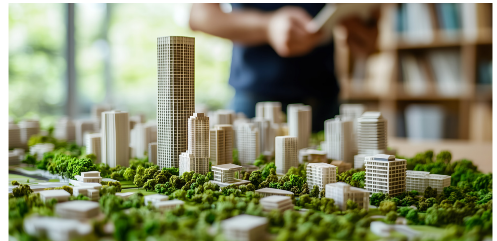
Expert guidance for the real estate and construction sector