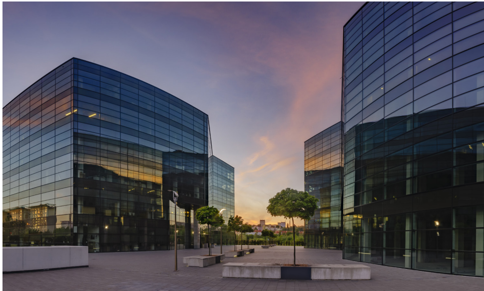
Expert guidance for the real estate and construction sector